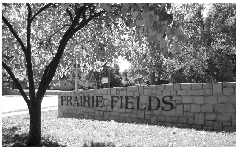
Photograph by Kirk Kiloh, Copyright Pending 2002